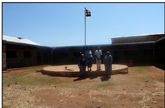
Rainwater catchment at Holy Family Primary School, Kiamuri. Built with a Rotary International Grant through the support of Utah Rotary Clubs and the Rotary Club of Rochester, MN.

If you've ever wondered about the impact of these types of projects, here's an update: Kiamuri – all of Tharaka District – is experiencing an extreme drought. Many people are subsisting on one cup of water a day. Stop for a moment and imagine that. Think about the quantity of water you use each day: to drink, to shower, to cook your food, to brush your teeth. Could you live on one cup of water a day? Without this water containment system, many villagers would have no water at all. There's no doubt that lives are being saved because of Rotary. This is but one example of how your donation to The Rotary Foundation makes a difference.