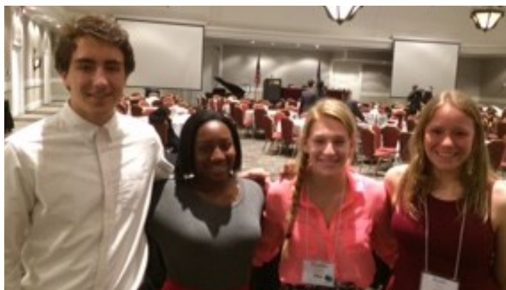
2015 Camp RYLA students

To make a donation and help provide shelter, warmth and dignity, please visit www.shelterboxusa.org/nepal .