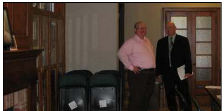
Olmsted County History Center