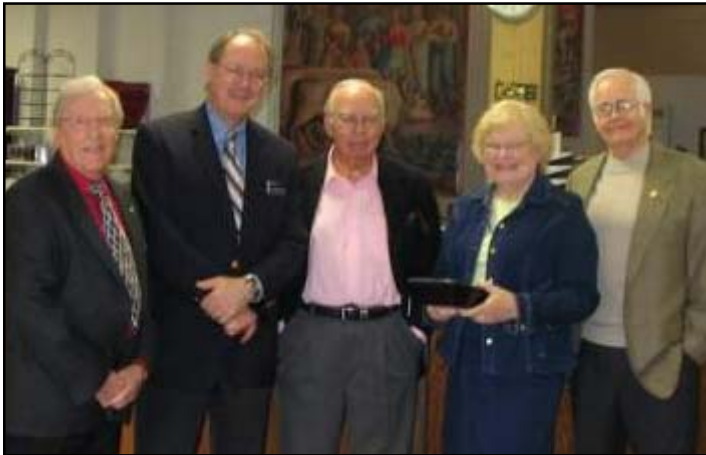
Olmsted County History Center