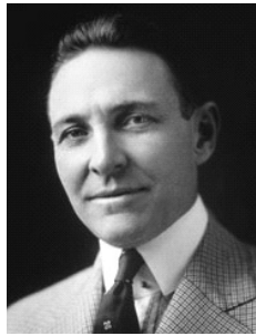
Arch C. Klumph, founder of The Rotary Foundation, circa 1916

Five Trustees, including Klumph, were appointed to “hold, invest, manage, and administer all of its property . . . as a single trust, for the furtherance of the purposes of RI.”