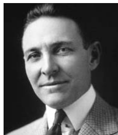
Arch C. Klumph, founder of The Rotary Foundation, circa 1916

In 1917, RI President Arch C. Klumph proposed that an endowment be set up “for the purpose of doing good in the world.” In 1928, when the endowment fund had grown to more than US$5,000, it was renamed The Rotary Foundation, and it became a distinct entity within Rotary International.