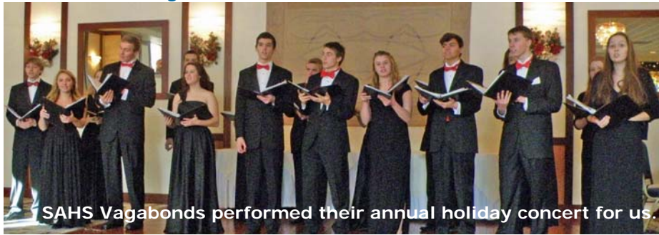
SAHS Vagabonds performed their annual holiday concert for us.