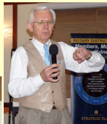
District Governor Kovarik