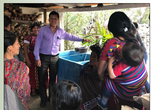
Clean water flowing to a village

money was used as intended ---which also supports our future efforts to fund Global Grants in partnership with other Rotary Clubs.