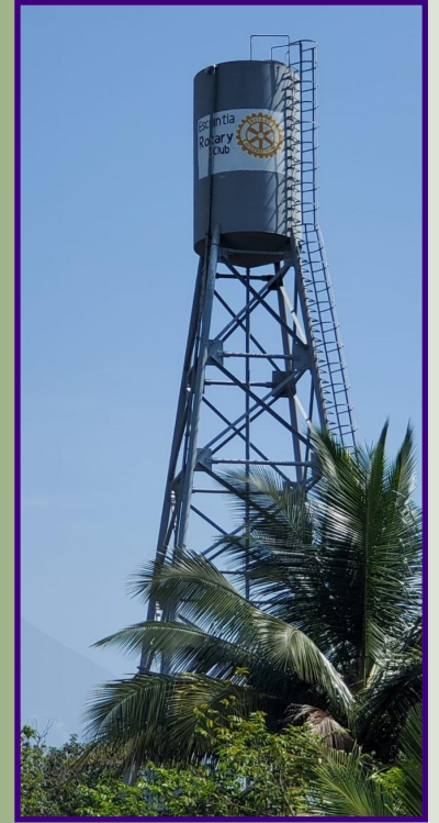
The Rotary logo proudly displayed on the water tank atop the 74 foot water tower.