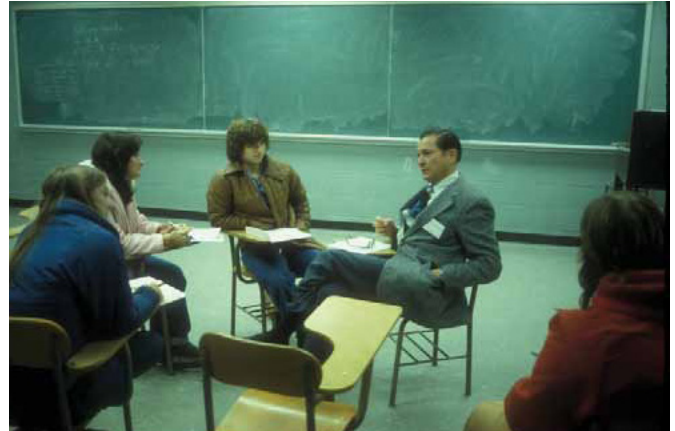
A Rotarian volunteers at Camp Enterprise, a 3 day camp aimed at educating high school students about the free enterprise system.