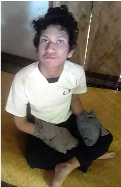
In his former home A lost soul