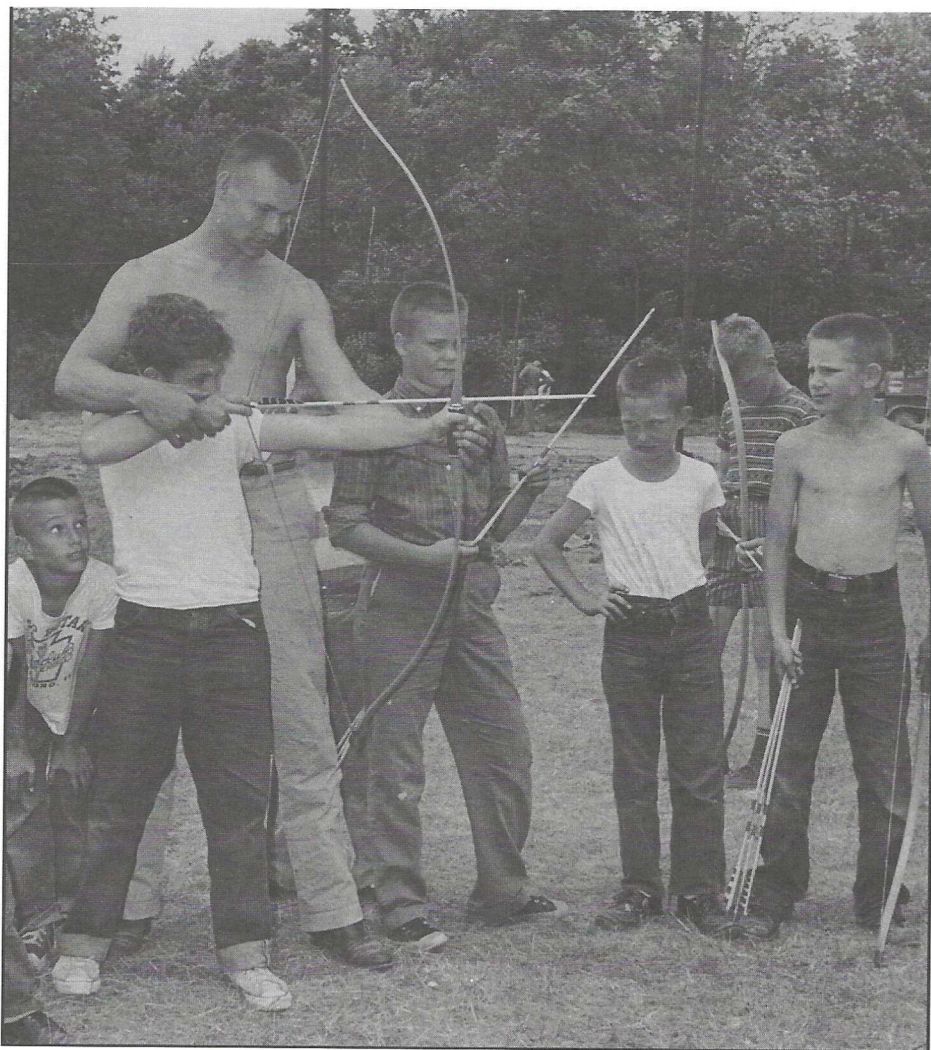
Camp Rotary gave youths an opportunity to learn skills, such as archery, in a natural setting. The camp had residential facilities, and the Rockford Boys Club provided instructors and other camp staff needed to conduct the camp's summer programs.