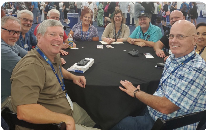
Brainstorming Session in Houston