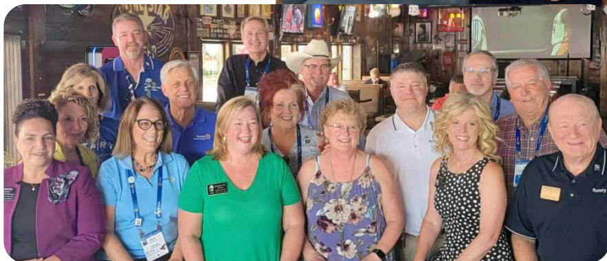
DG Mary's Zone Classmates – District Governors from Zone 30 and 31 at the Houston Convention