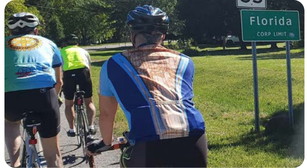
The bikers covered two Ohio towns named after states, in the same day – Florida and Texas.