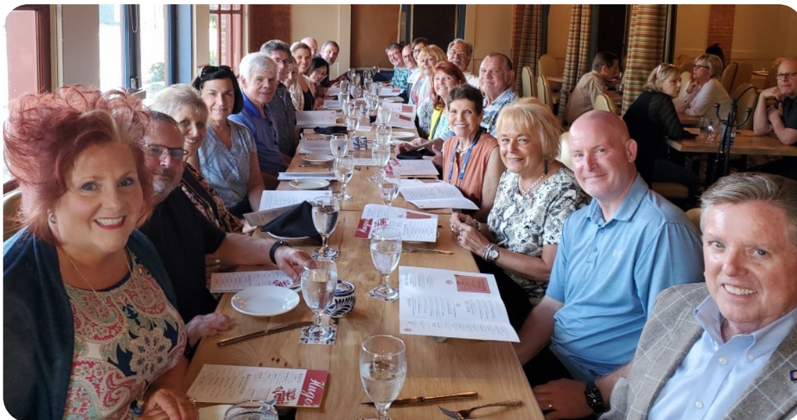
District 6600 dinner party at Hugo's in Houston