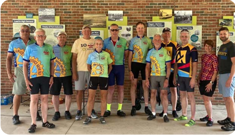
Middlegrounds Park in downtown Toledo