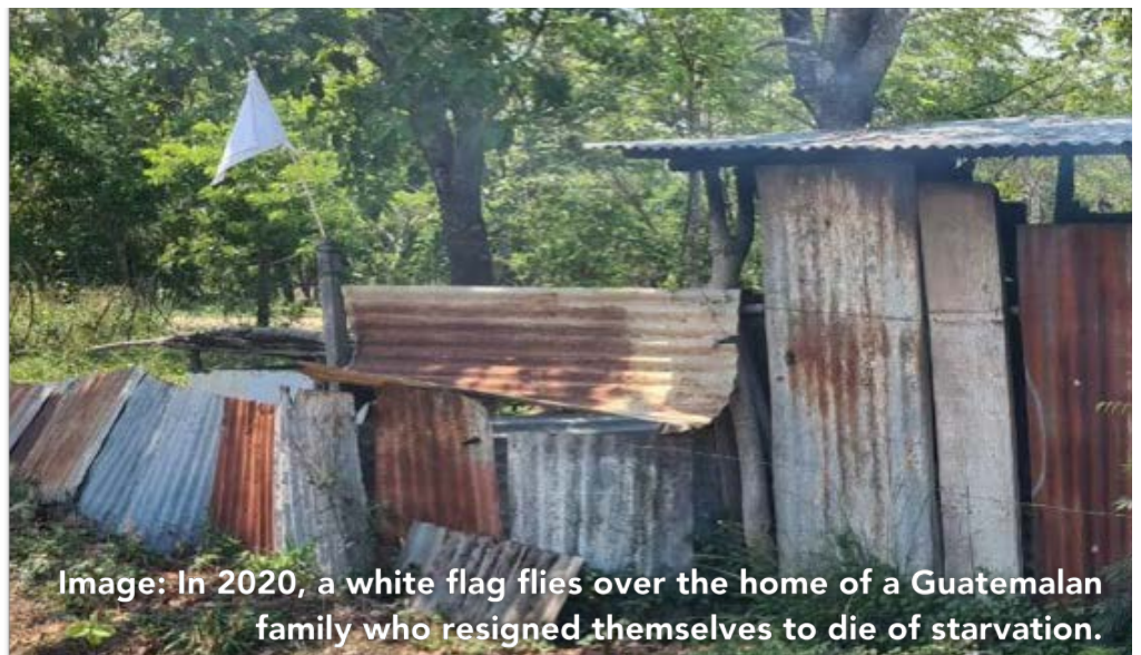
Image: In 2020, a white flag flies over the home of a Guatemalan family who resigned themselves to die of starvation.

For more information or to get involved, visit: sewhope.org/community-food-packing-event