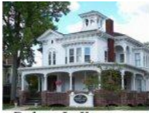
Robert L. Yost Funeral Home, Inc