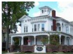
Robert L. Yost Funeral Home, Inc