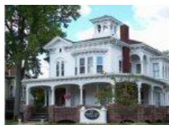
Robert L. Yost Funeral Home, Inc