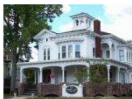
Robert L. Yost Funeral Home, Inc