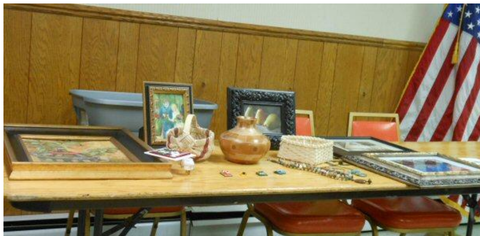
A sampling of the many artworks created by members of Wayne Arts and available for sale at the groups gallery store.