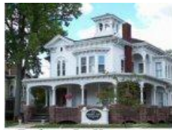
Robert L. Yost Funeral Home, Inc