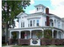
Robert L. Yost Funeral Home, Inc

J.D.Chapman AGENCY, INC. General Insurance Since 1958