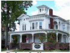
Robert L. Yost Funeral Home, Inc