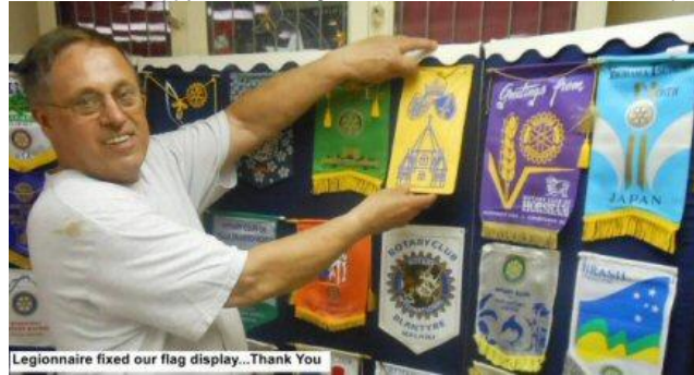
Legionnaire fixed our flag display...Thank You