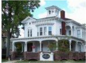
Robert L. Yost Funeral Home, Inc