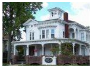
Robert L. Yost Funeral Home, Inc