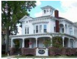
Robert L. Yost Funeral Home, Inc