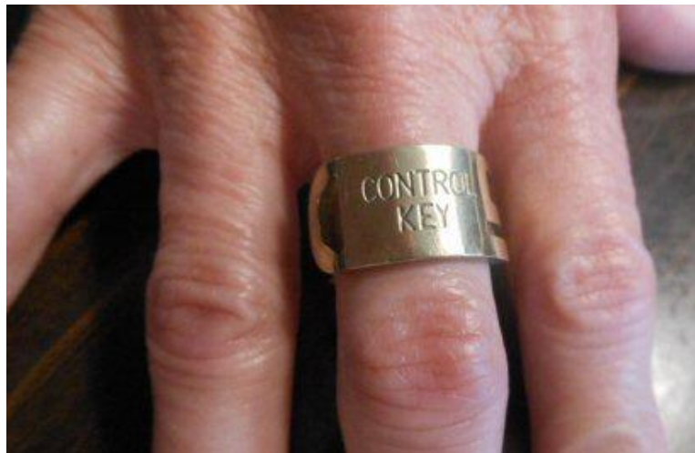
One of the more popular ring styles, the "control" key.

The company keywords are "Individuality, Social Good, Sustainability." There are thousands of unique keys in different colors, shapes and materials, so no two JoJo Rings are exactly alike. $5 from each ring sale is donated to a local charity. The first month in business that was Vera House. Next was the Food Bank of Central New York. More organizations will benefit in the coming months. All of the keys are donated, which keeps them out of landfills and junk drawers. Some are donated by individuals; many have been donated by locksmiths, faulty or imperfect keys from their shops.