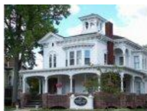
Robert L. Yost Funeral Home, Inc