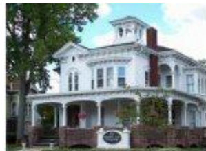
Robert L. Yost Funeral Home, Inc