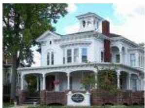
Robert L. Yost Funeral Home, Inc