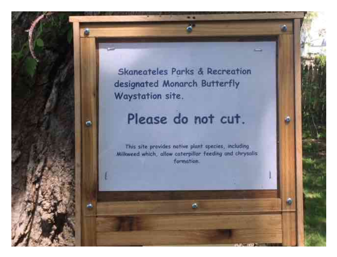
Austin Park – Monarch Waystation