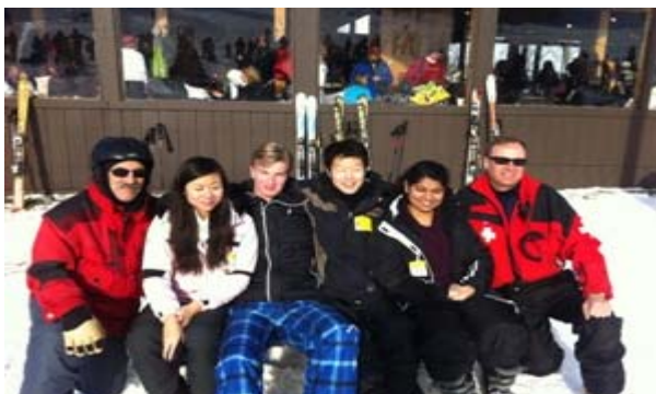
2013 Youth Exchange Song Mnt. Ski Trip

“If you have much, give of your wealth; If you have little, give of your heart.” ~ Arab Proverb