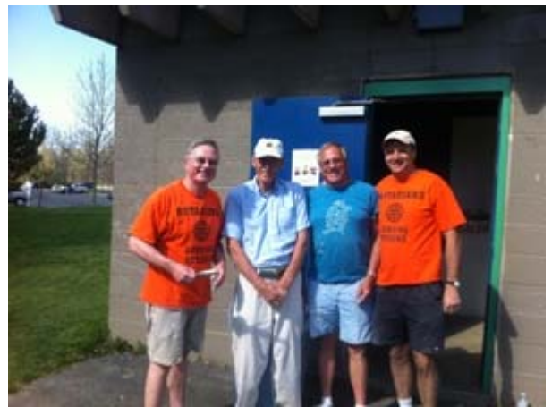
Skaneateles Rotary Bath room & Bleachers 2013 service project