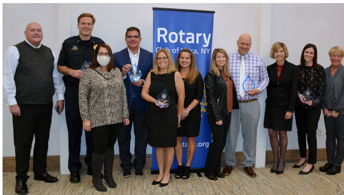
Right: 2020 POW award winners and their nominators.