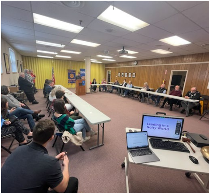
April 1st Program Meeting at Mid York library System

A flyer on Global Youth Initiative is also included at the end of this newsletter.