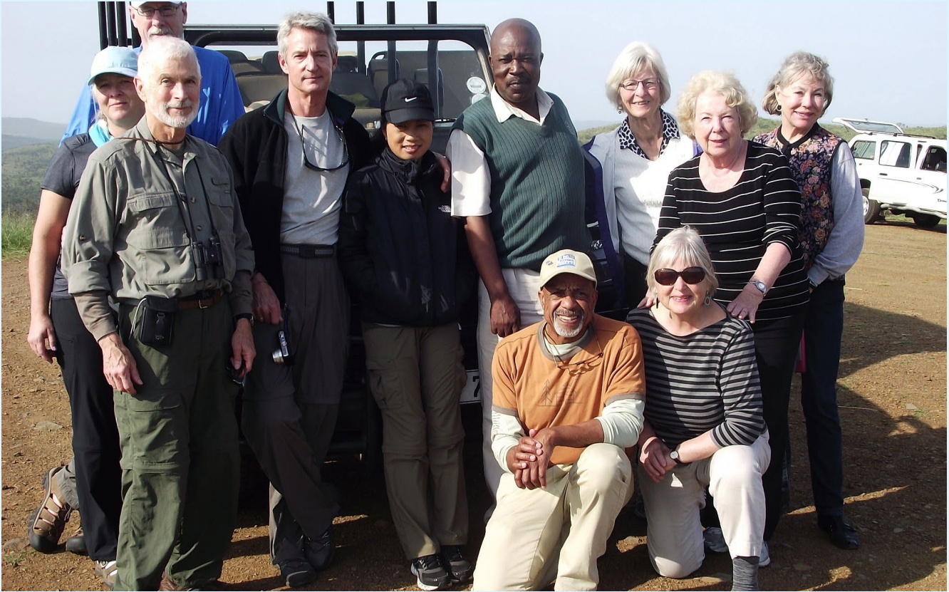
Dave went on an humanitarian South African tour to support NGO non-profits related to female sexual abuse and AIDS. He also got to spend a couple of days on a safari.