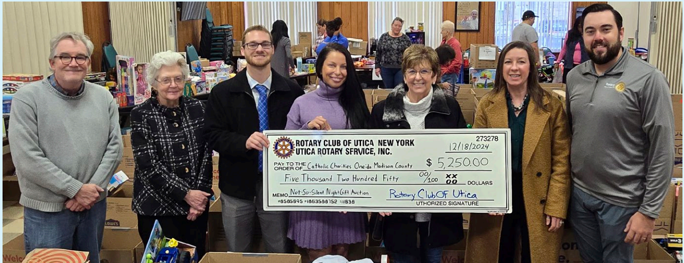
Utica Rotarians visited the offices of Catholic Charities on Dec. 15 to present a check for $5,250, representing the proceeds from the club's "Not So Silent Night" Auction.