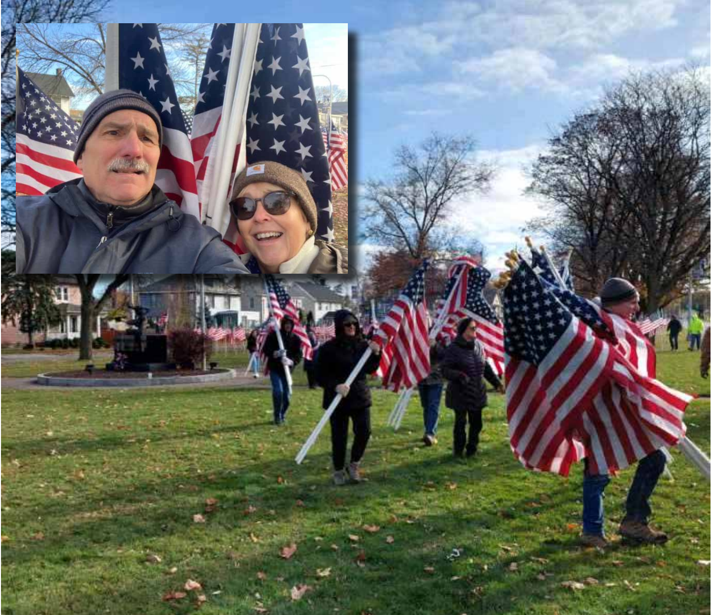
Rotary members and family help remove flags at the conclusion of the “Flags for Heroes” project.