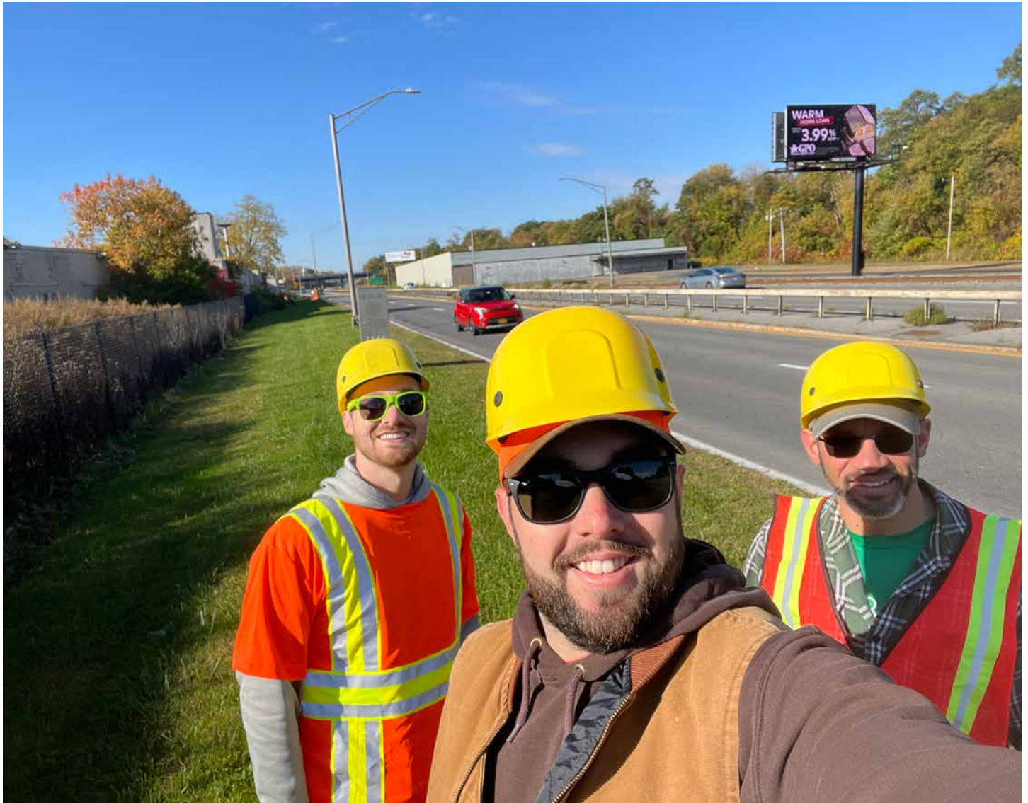
Some of the Rotarians cleaning up the Route 12 arterial.