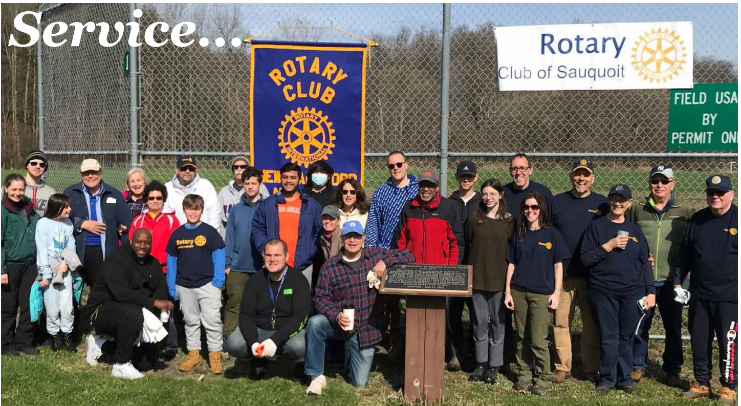
Rotarians and friends at April's Sauquoit Creek cleanup project (above and below).