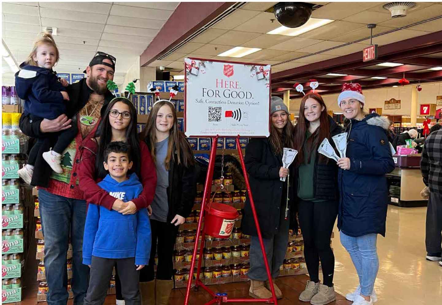
Rotarians and family members turned out to ring the bells for the Utica Salvation Army.