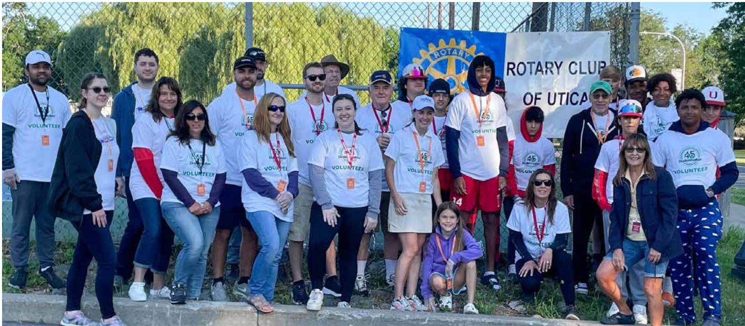
Rotary members, family and friends at the Boilermaker Road Race (above and below).