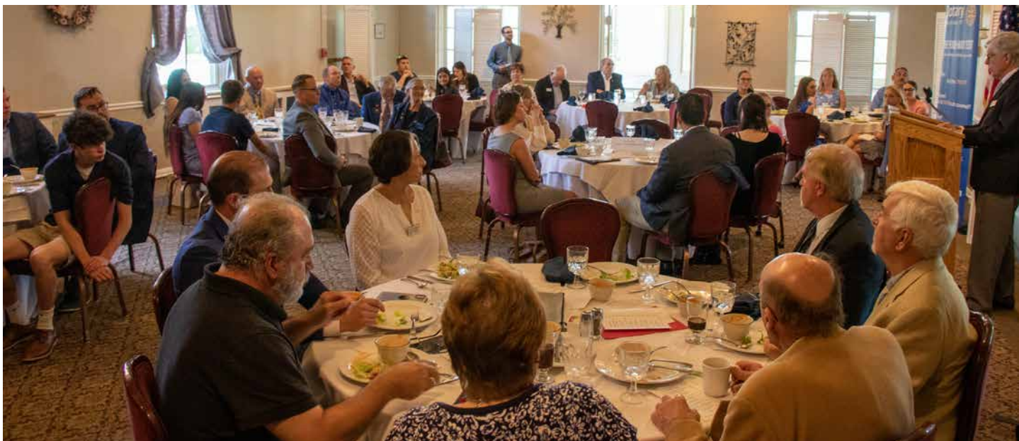
Rotarians, students and teachers at the Outstanding Educators awards luncheon.