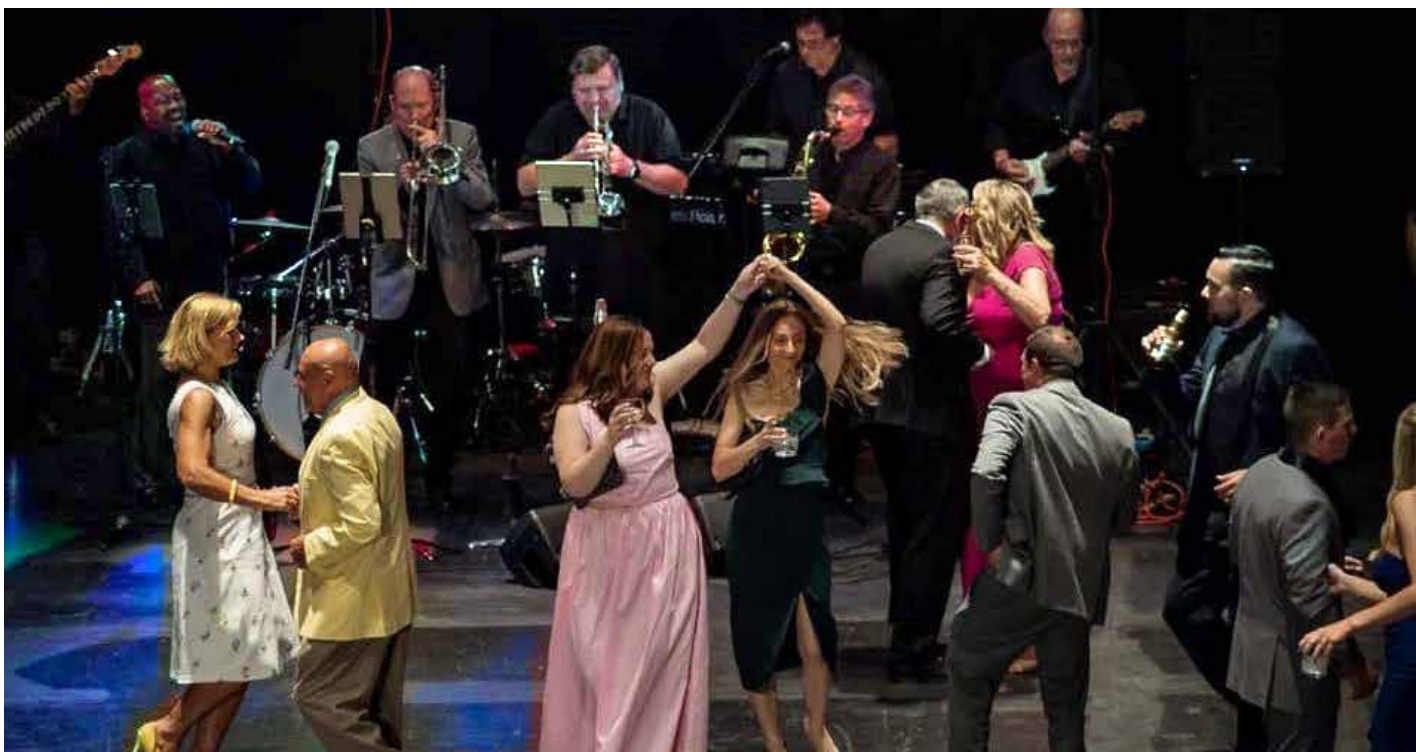
Inaugural ‘Service Above Self’ Gala benefitted “Camp Abilities”