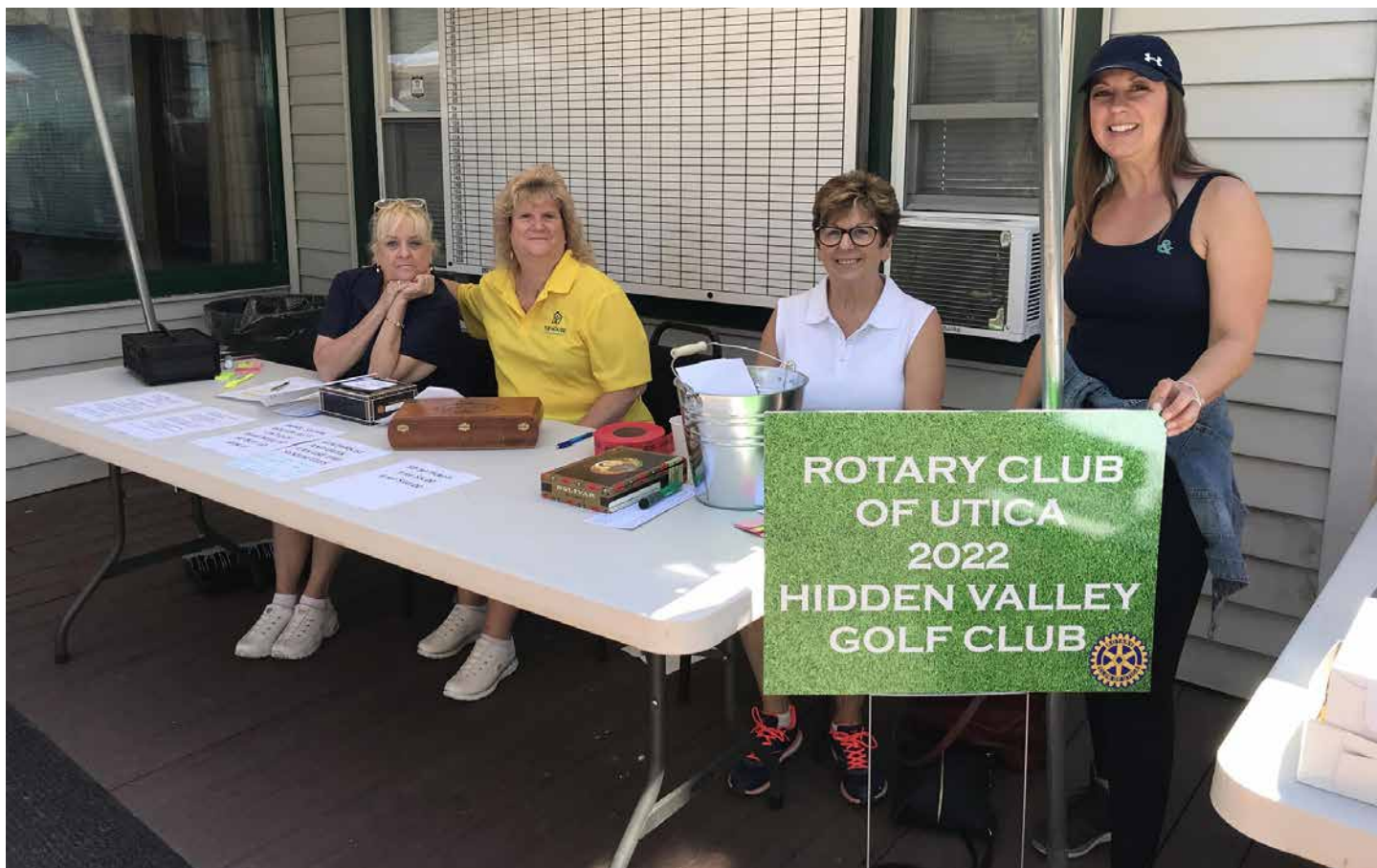
Rotarians staff the check-in station at the 'Tees for Trees' Golf Tournament.