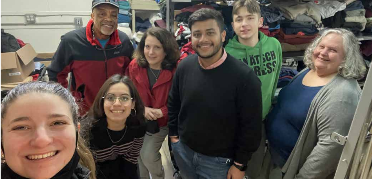
Students and Rotarians at Morrow Warming Center in March.

Despite winter's lingering breath, club members dove right into service projects.