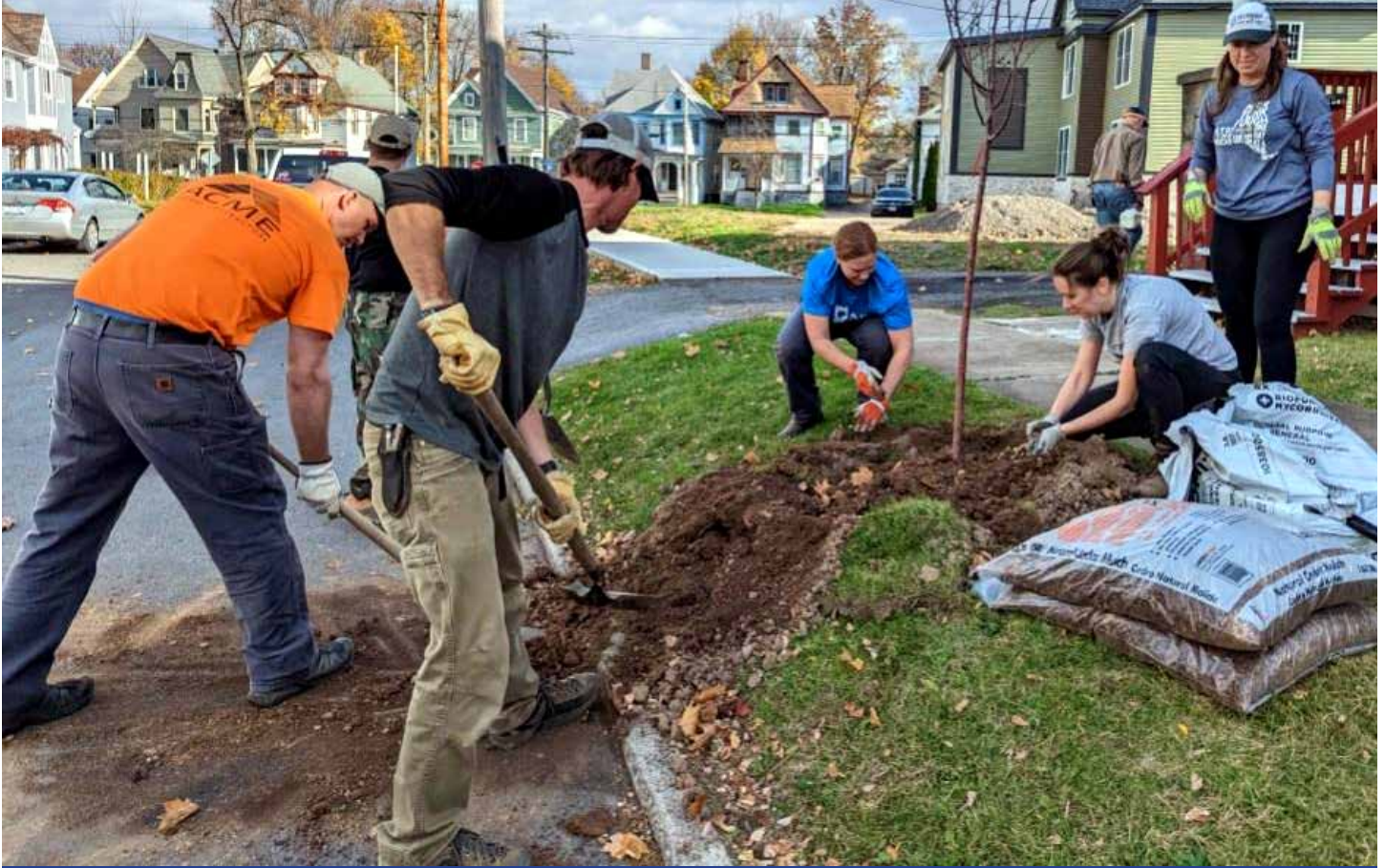
Rotary members, family and friends planted trees around the City of Utica.