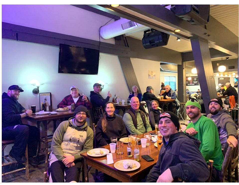
Enjoying the snow and food at Gore Mountain, and (below and next page) the soccer game from the Biergarten at the Utica Memorial Auditorium.