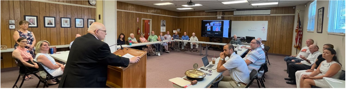
Rotarians packed the meeting room at Mid-York Library System headquarters, both physically and virtually.