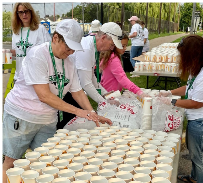
Rotary volunteers set up water station on the Parkway and hand out drinks