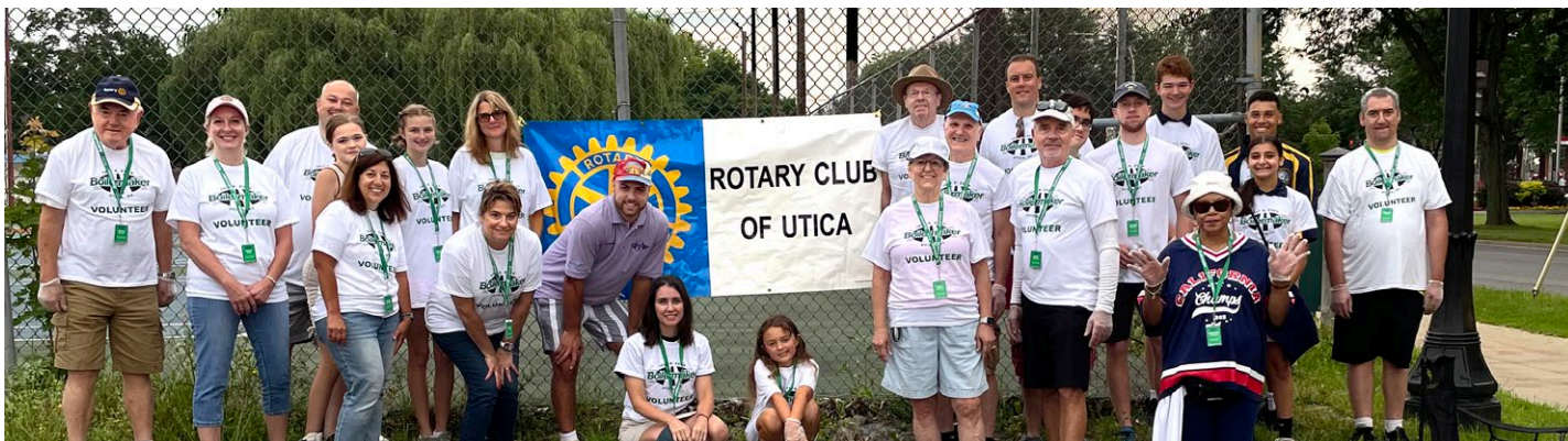
Rotary volunteers showed up as early as 6 a.m. on Sunday, July 9, to be ready to serve refreshing water to runners in the Boilermaker 15K Road Race, Photo by Linda Iannone.