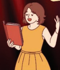
POETRY SPOKEN WORD