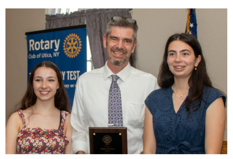
Clinton Central High School