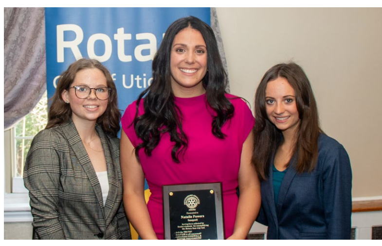
Sauquoit Valley High School