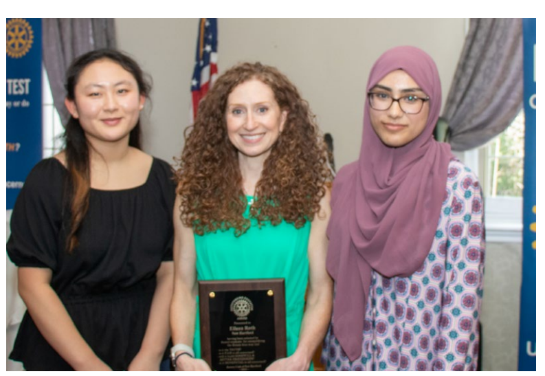
New Hartford High School