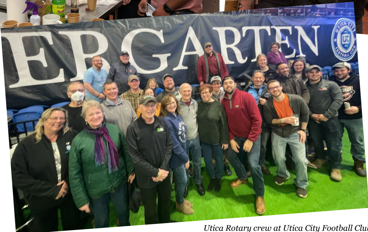
Utica Rotary crew at Utica City Football Club match on March 27, 2020 at Adirondack Bank Center