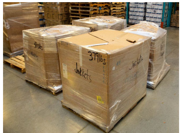
Firefighting equipment packaged by CABVI.