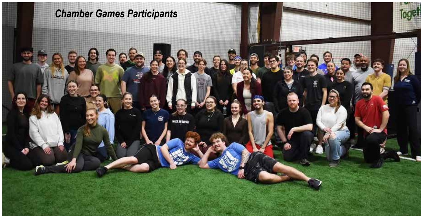
Chamber Games Participants

Some participants even walked away with medals, but everyone left with bragging rights, new connections, and a great night of friendly competition.