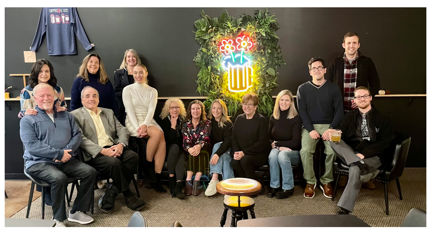
Utica Rotarians had a great time at the monthly social held at Grow Brewery last Thursday!

eighth floor; a diagnostic center including interventional radiology and advanced endoscopy; a Level III Trauma Center, plus the ability to serve 90,000 emergency visits per year; medical imaging; pharmacy; world-class lab; oncology services; a behavioral health unit; critical care services and medical/surgical care.