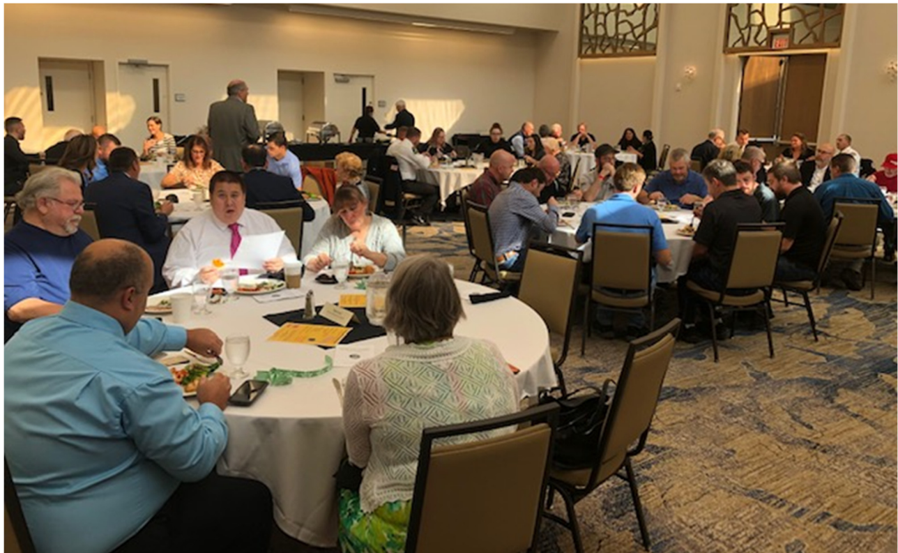
Pride of Workmanship Awards Program on October 15, 2021

Donations of a clean, gently worn coat can be made before November 15 to Elizabeth Nassar, 207 Hartford Place, Utica; at a Rotary meeting; or at Turnbull Insurance, 600 French Road.