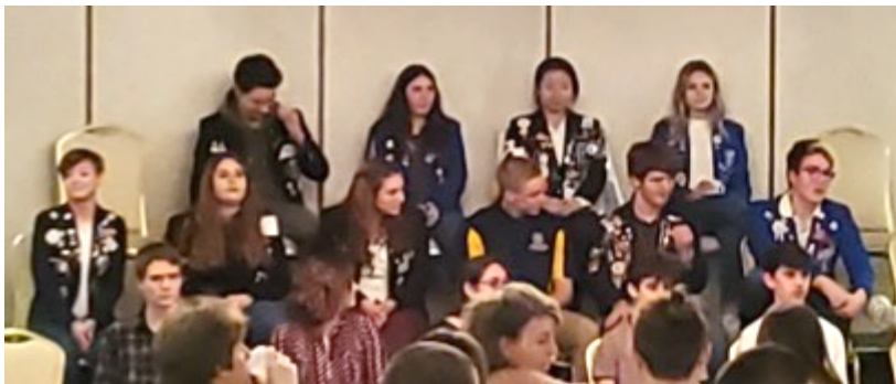
Youth Exchange Students from Districts 7280, 7305 and 7360 at the International Dinner.