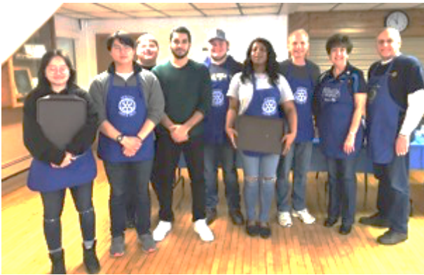
The Rotaract Club of Pitt Bradford helped at the Pancake Breakfast hosted by the Bradford Rotary Club.