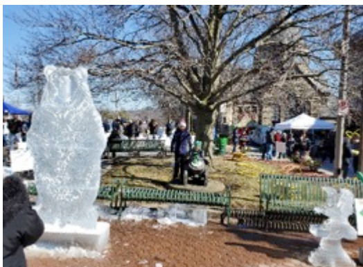
Beautiful day for Butler AM's Carved in Ice event.