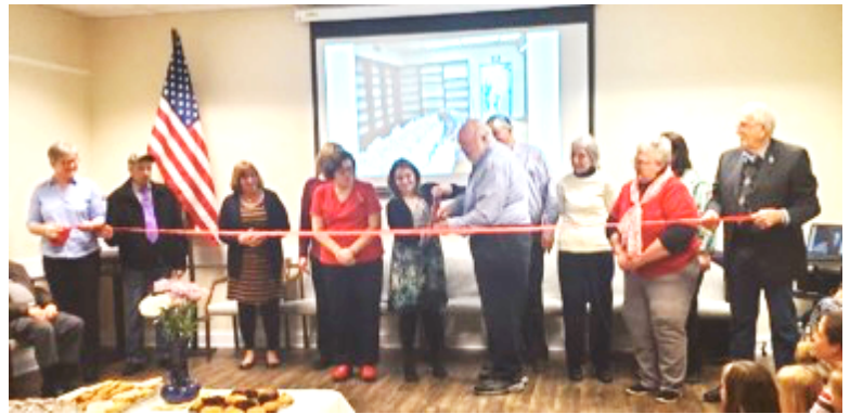
Congratulations to the Evans City Rotary on the dedication of the new community room at the Evans City Library.