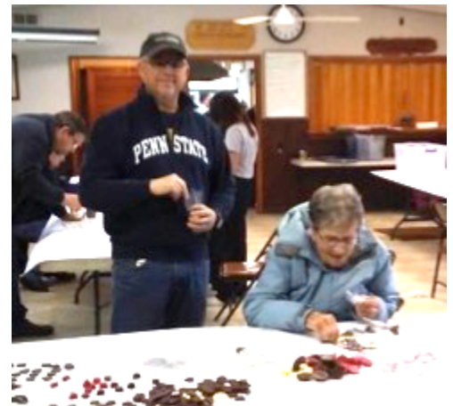
Mt. Jewett Rotarians preparing some "goodies" for their Chocolate Indulgence Fund Raiser.