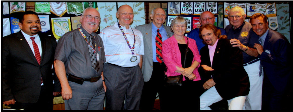
Thanks to the Rotary Noon Board of Directors 2017-2018