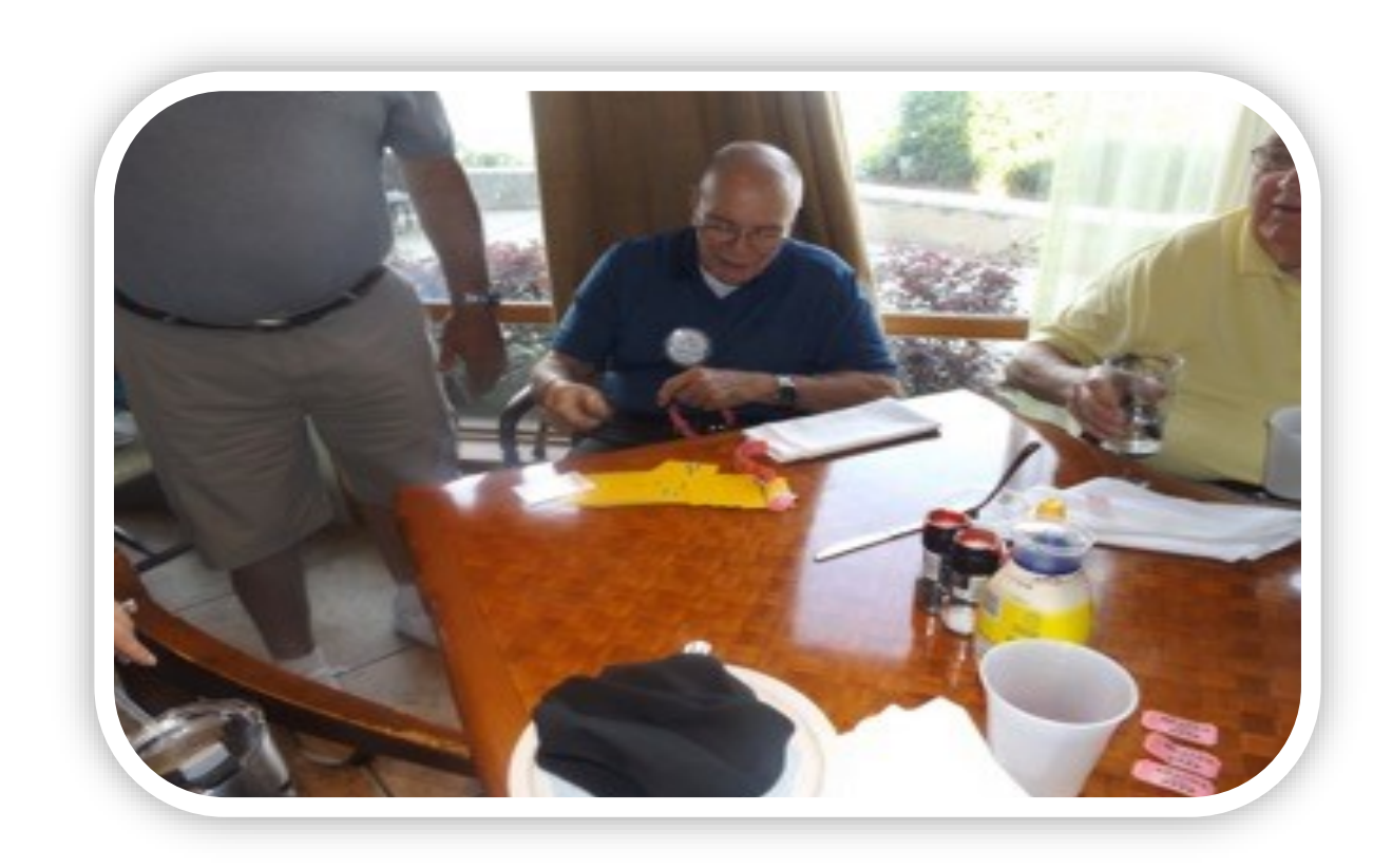
Over $451.00 up still up for grabs

There are only 35 cards on the table that is all that is left between you and the pot, Todays winner draws the the wrong card, the Joker is waiting for you to start over again next week.