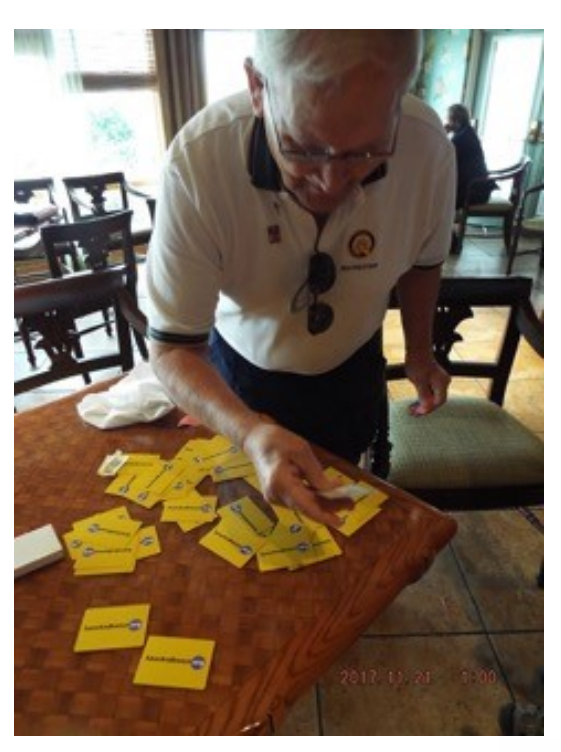
Over $100.00 up for grabs