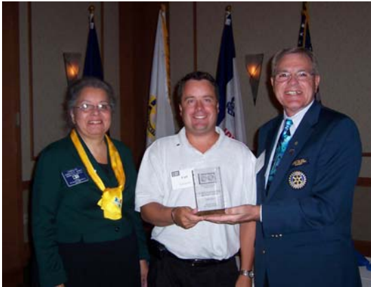
2nd in Per Capita Giving