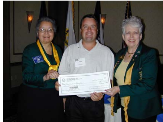
District Simplified Grant